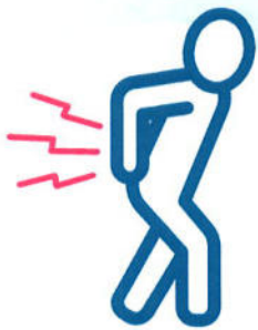
MUSCLE OR BODY ACHES