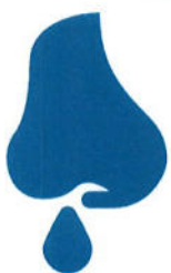
CONGESTION OR RUNNY NOSE