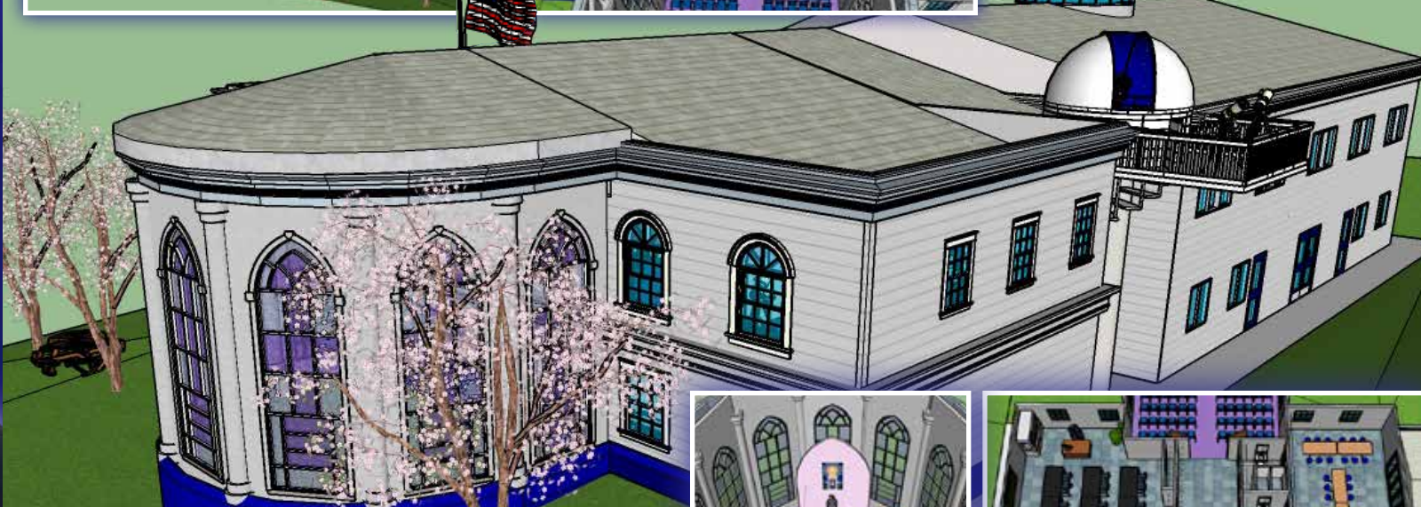
Top Left: Exterior Top Right: Second Floor multi-purpose/music room. Middle: Exterior from the road showing Telescope platform on the right. Bottom-Left: Sanctuary Bottom Right: First Floor Science classroom (left), Student Dining Hall (right) & Stairwell/Elevator building connection extension.