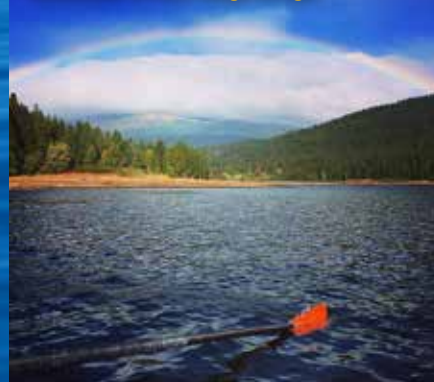
Gratitude & New Beginnings!