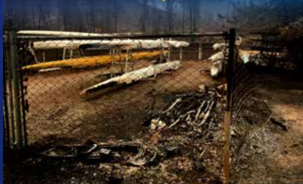
Carr Fire Devastation, Whiskeytown Lake

Last year the high school students got to try their hand at rowing for the first time, and it was extremely well received. So much so, we reached out to neighboring Rowing Clubs to see if anyone had any secondhand boats for sale, with the thought being perhaps we could have a high-school team one day. Well! We were not prepared for the enormous generosity of the Shasta Rowing Association based an hour from Mt Shasta in Redding, CA. They literally said, “Please take some boats, we don’t use them all, you are welcome to have them!” However, on the very week before we came to pick them up, the devastating and lethal Carr Fire swept through the rowing headquarters, destroying many boats, and all their sculling oars—an enormous loss. We headed down as soon as we could to help them move boats out, and they kindly gave us the trailer that remained (although it needed new wheels as the existing ones had melted!). We, so very gratefully, have been given five boats to start our rowing team, and one on loan. We now have two fledgling novice crews, and are hoping to race in December and February. We like to think the rainbow we saw was a sign of gratitude ( top right )—and of new beginnings, new energy, and new goals for Shasta Rowing!