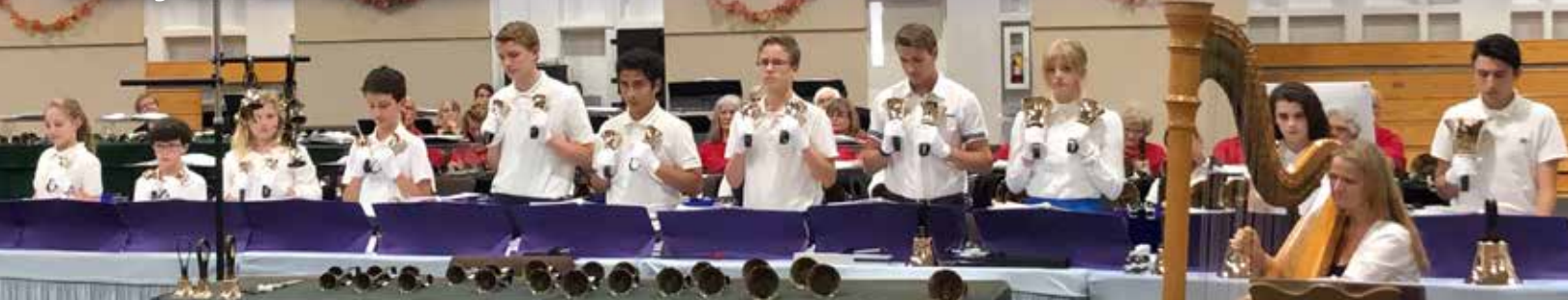
Redding Bell Choir Festival 2018